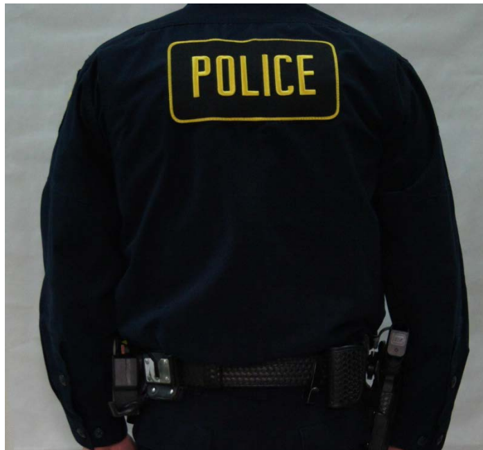
Class C Uniform