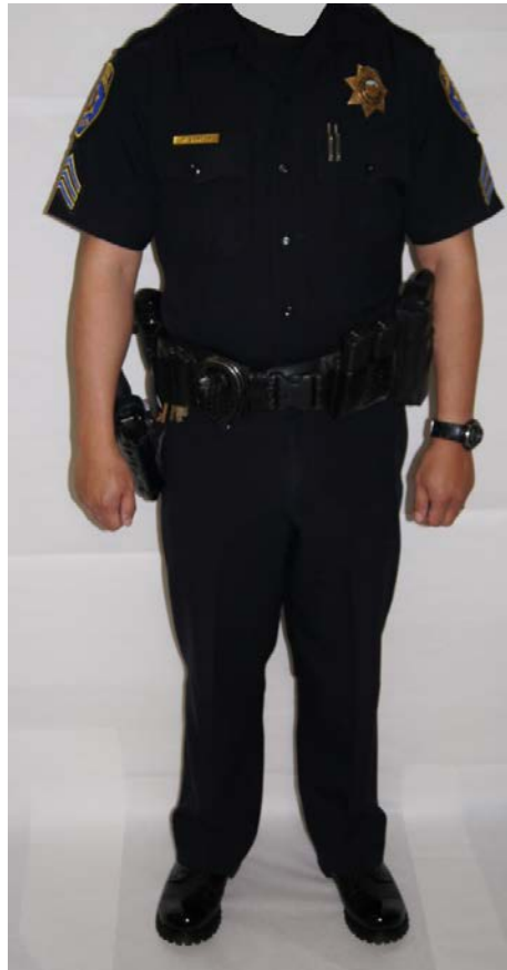
Class B Uniform