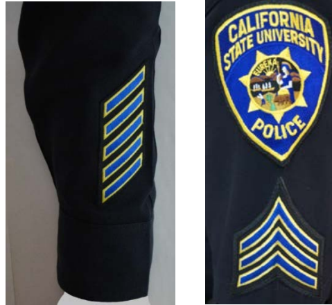
Service Stripes Sergeant Chevrons