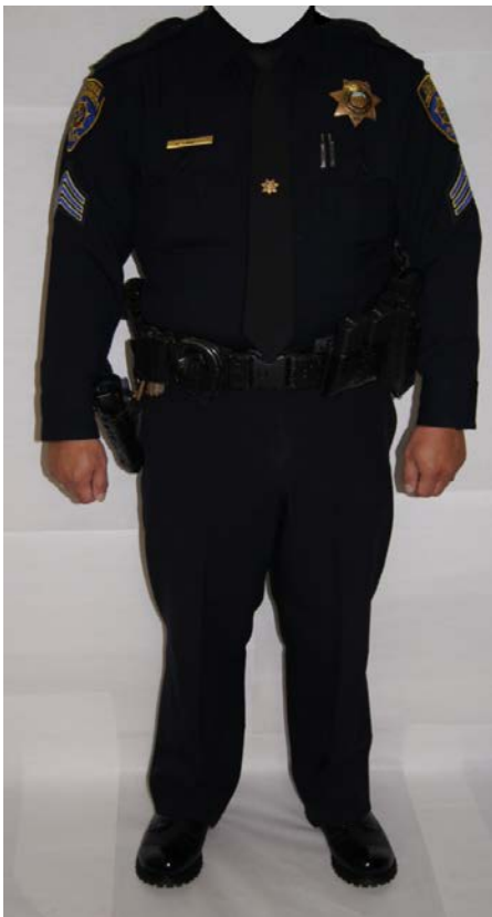
The Class A Uniform