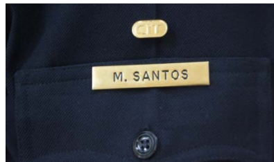
Nameplate and Device Placement