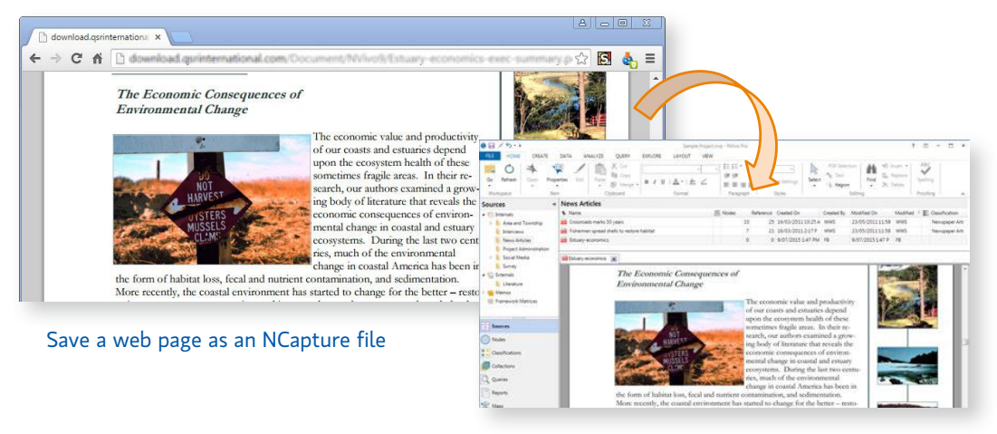
Import it as a PDF source

NCapture is a browser extension that lets you clip web pages and import them as PDF sources into your NVivo project.